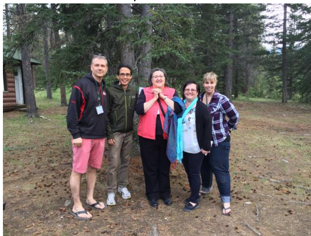
Bow Valley College Hosting Committee

Thank you to all who attended this year's conference, to the presenters for their outstanding sessions, and to the Bow Valley College Conference Hosting Committee for all of their time and effort to help ensure that the conference ran smoothly.